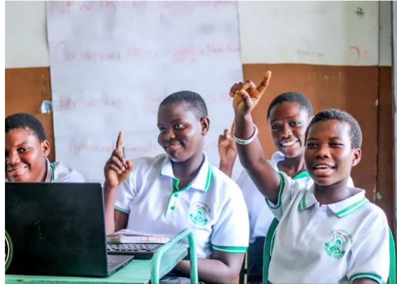
Students learning Internet Safety during outreach visit by Ashanti Regional Library