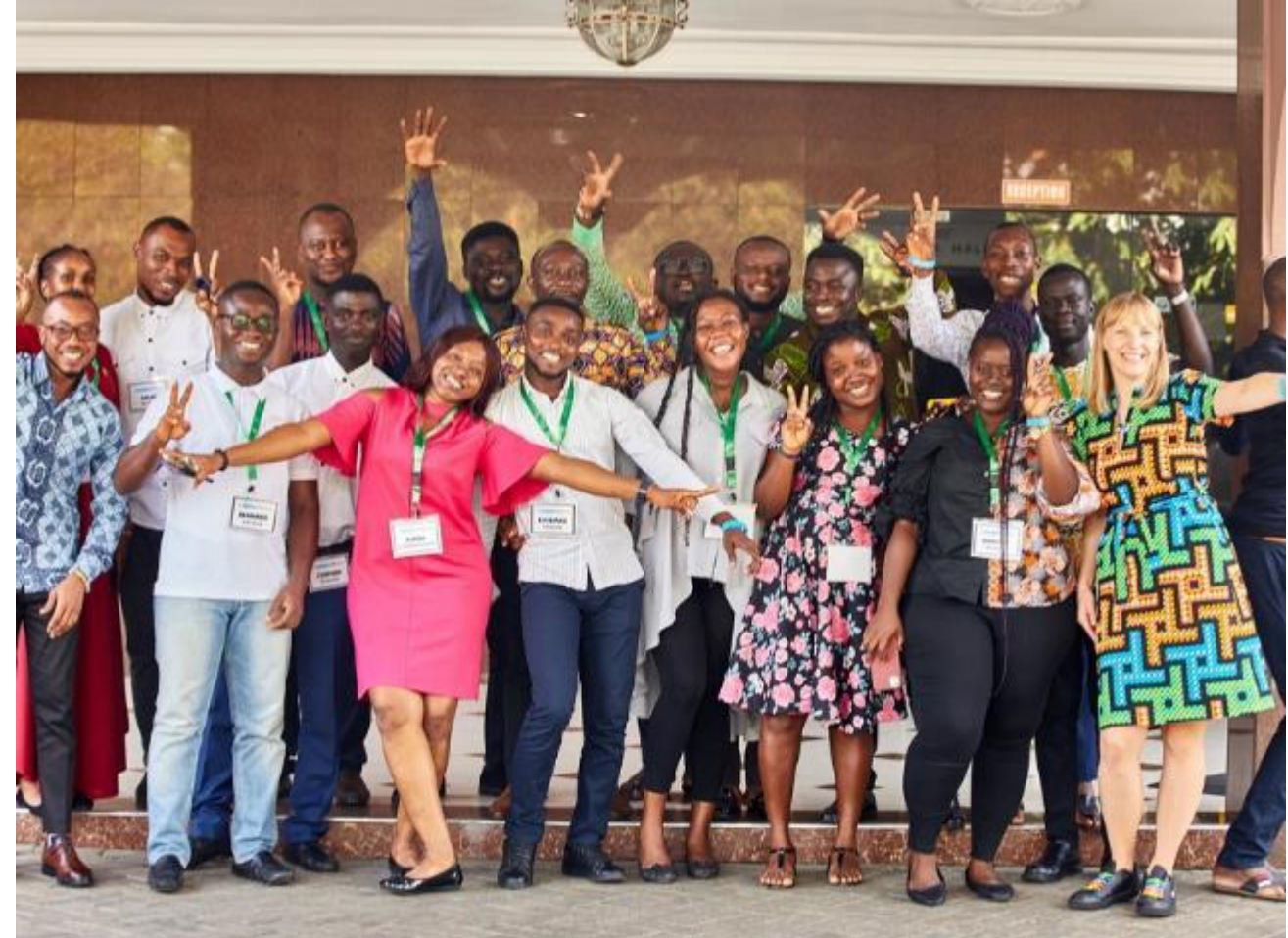
Participants of the Training of Trainers programme