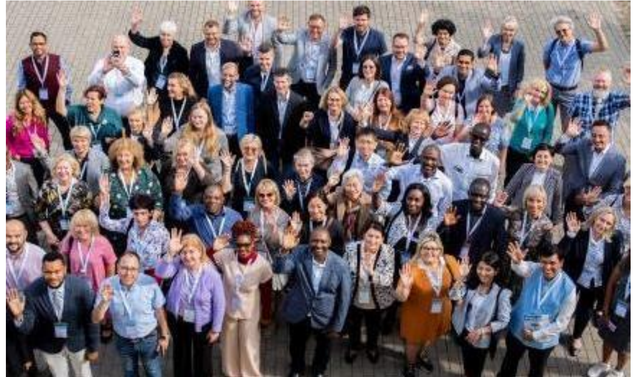
EIFL General Assembly 2023 in Vilnius, Lithuania