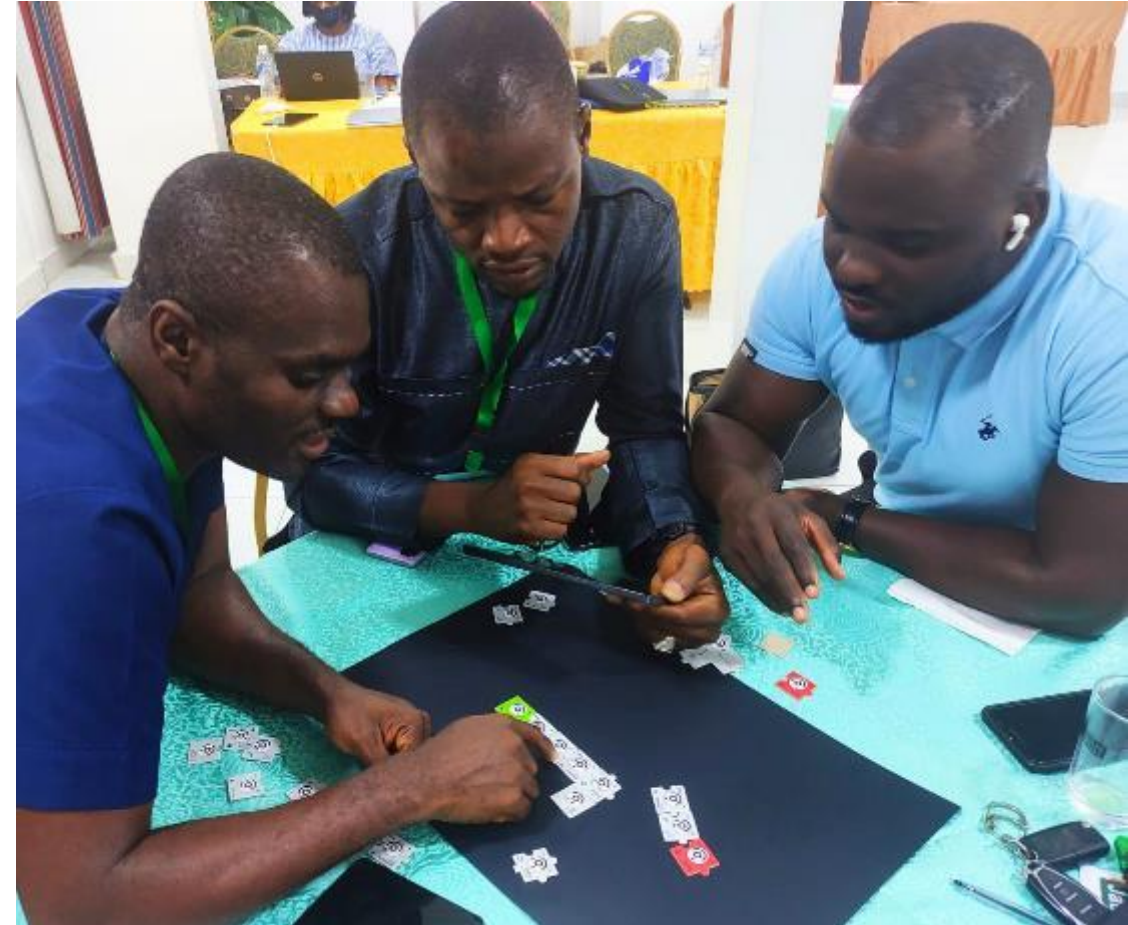
ICT coordinators are learning to use the coding game