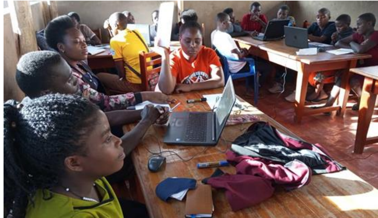
Digital skills training at Nyarushanje Community Library