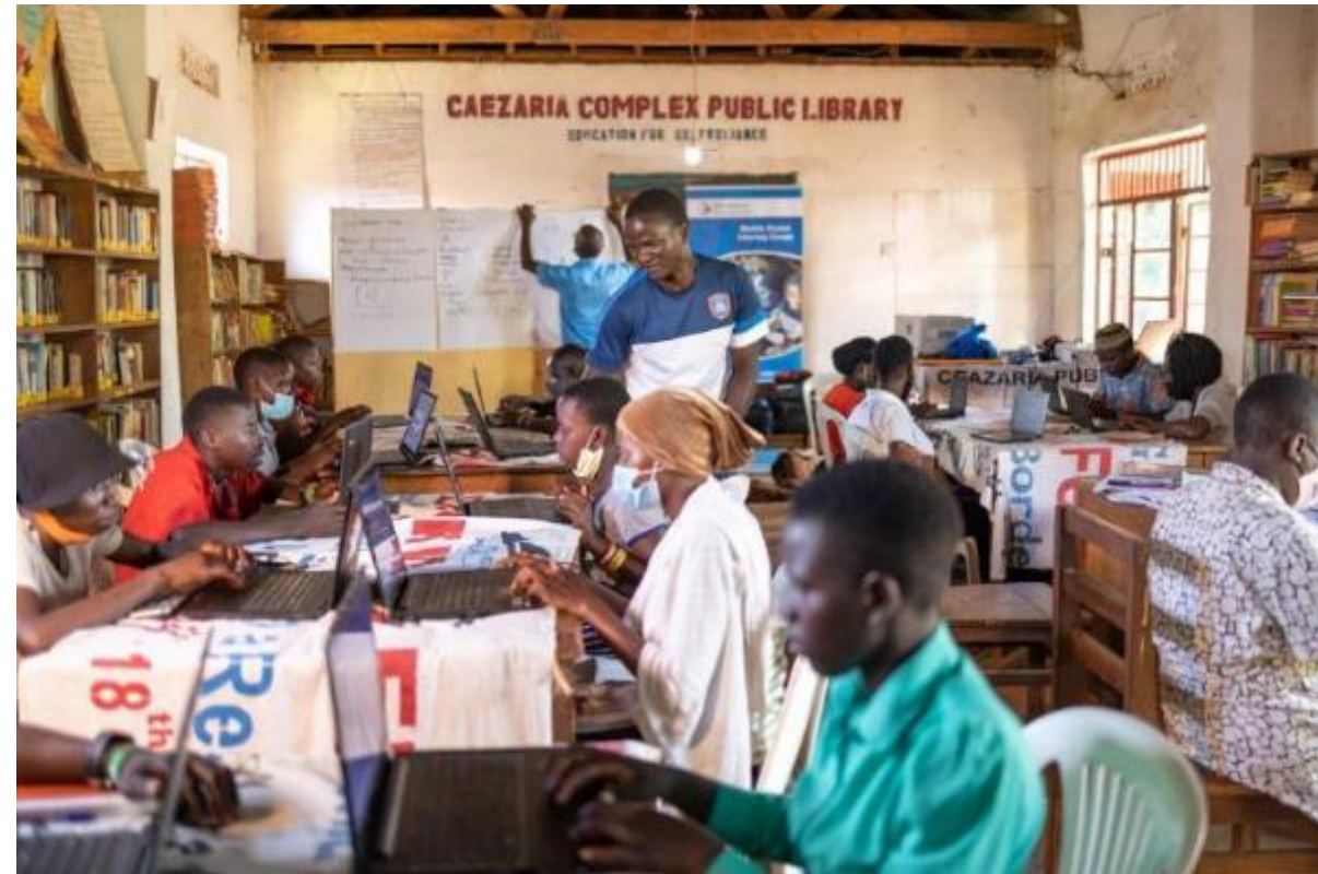
Digital skills training at Caezaria Complex Public Library